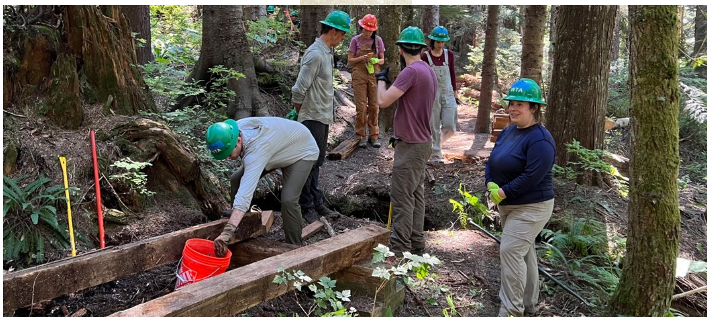
Corporate work party building a puncheon at Franklin Falls.

The cost to participate in a private work party for your team is $2,500. If you have team members that wish to participate in a volunteer opportunity with WTA but don't need a private work party, you can find volunteer opportunities at wta.org/volunteer .