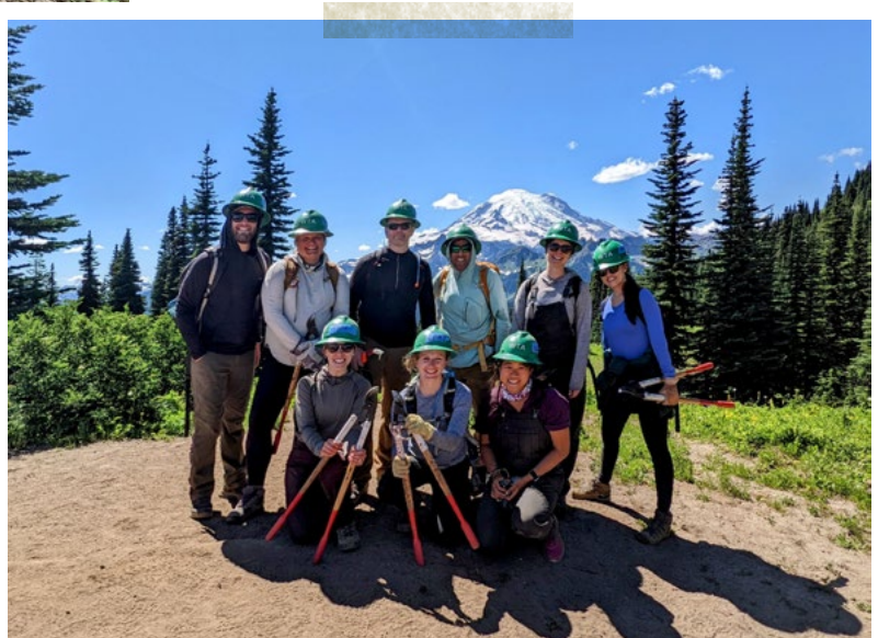
Coworkers enjoying their time on trail together.