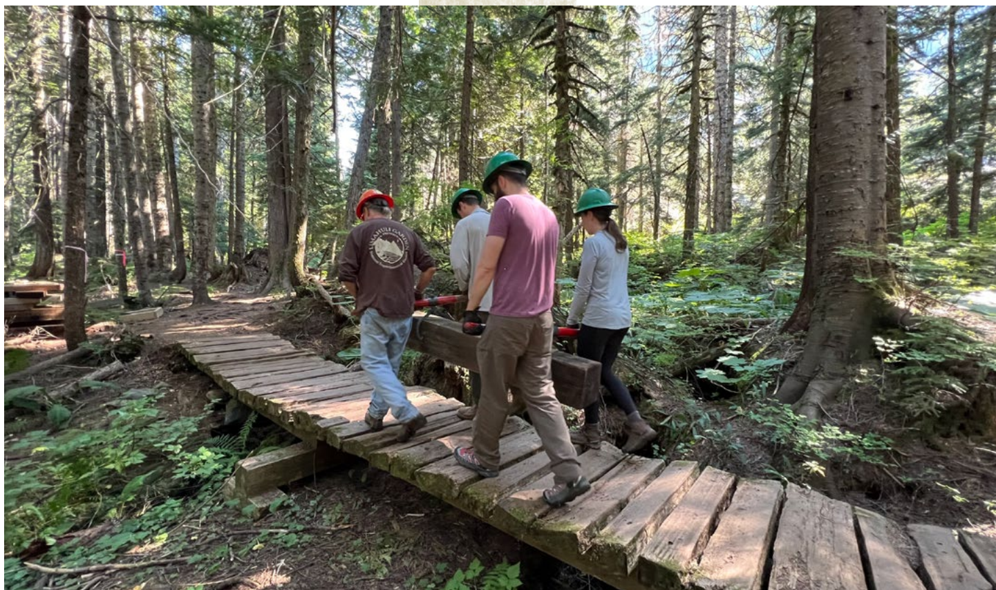
Working together to carry materials at Franklin Falls.

All volunteers should wear a sturdy pair of close-toed shoes (work or hiking boots strongly preferred), long pants and work gloves. It's also recommended that you wear a long-sleeve shirt and eye protection (such as glasses, sunglasses or safety glasses). In addition, bring rain gear and extra warm clothing in a pack.